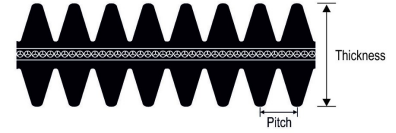
Reference Profile: DPL